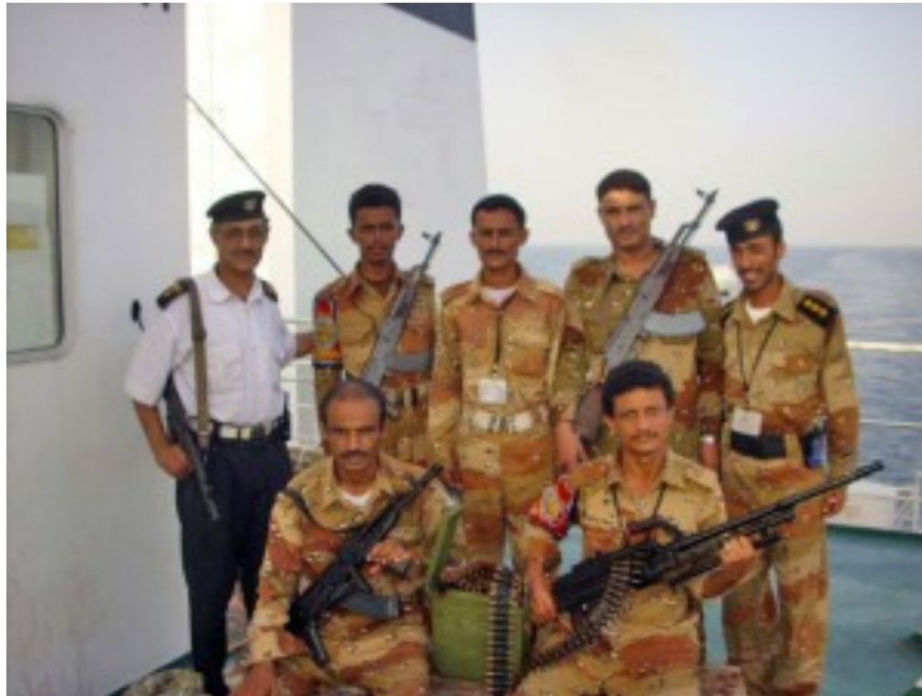
Yemeni security team in the employ of Gulf of Aden Group Transits (GoAGT)