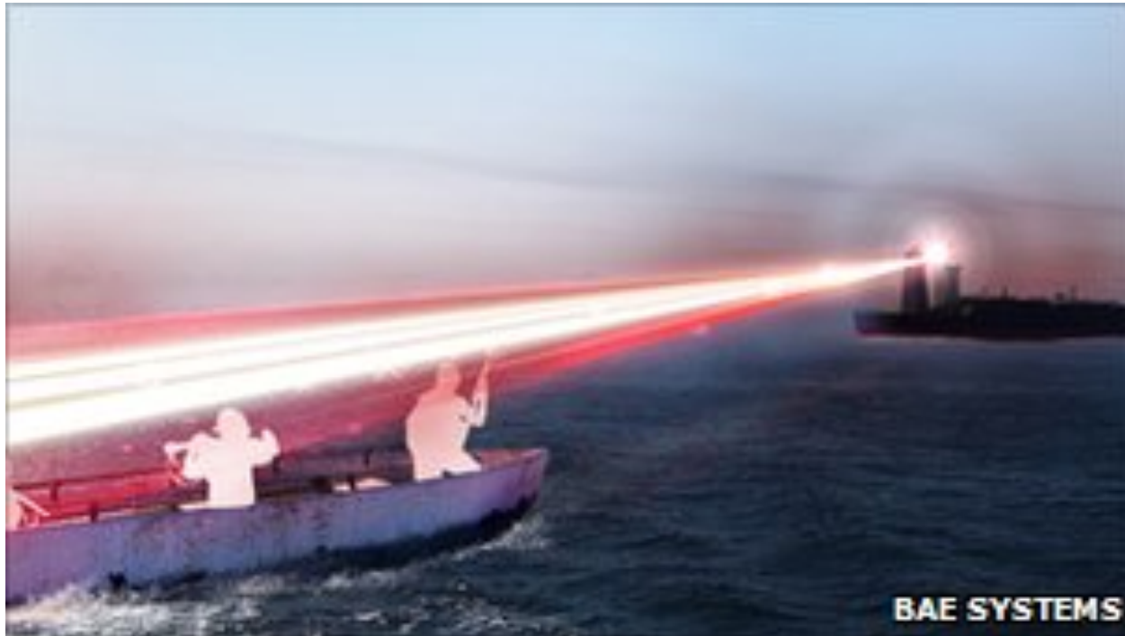
Artist's representation of the BAE laser distraction system